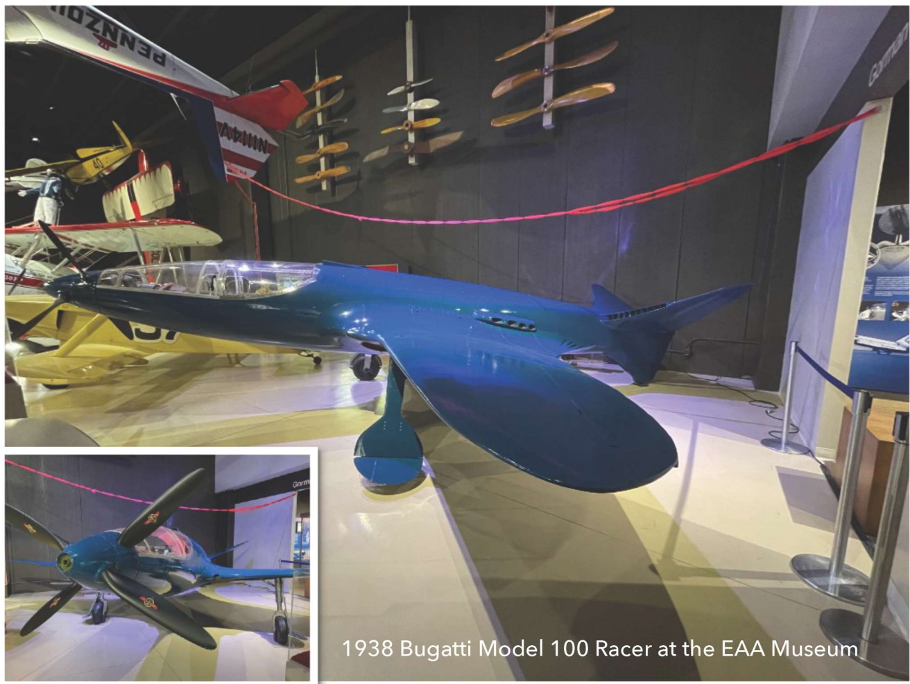
1938 Bugatti Model 100 Racer at the EAA Museum

Tickets for EAA AirVenture at www.AirVenture.org . This years dates are July 22 through July 28, 2024, see you there!